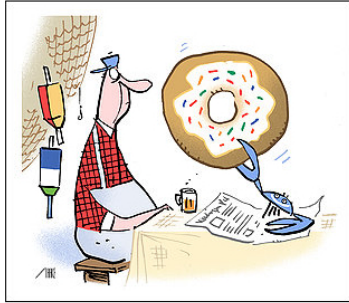
(Bob Staake for The Washington Post)